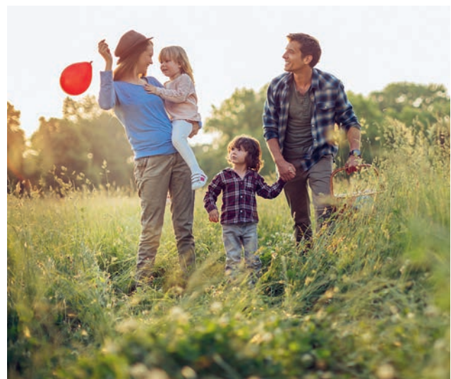
Family in the nature.