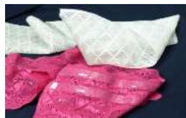
Tape coating with ALPATEC 641