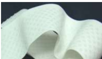
Dot coating with ALPATEC 630