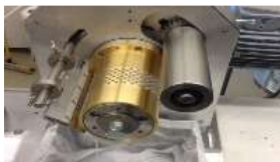
Coating head for dot coating

COLORMATCH SI colour range Colour range for silicone systems.