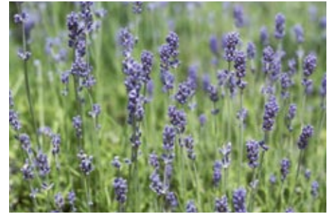
Lavender fragrance for a calm and relaxing sleep