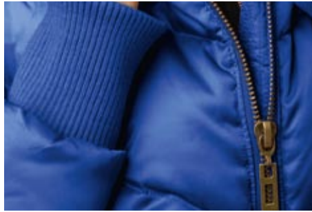
Perfect care for your down jacket